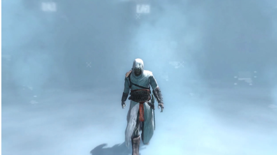
Figure 4: Screenshot of the playable “Animus” loading sequence from Assassin's Creed .

Upon release, Assassin's Creed (Ubisoft Montreal 2007) surprised players with its frame story narrative structure, wherein the player character existed in a technologically advanced present and used a virtual reality device to access a simulated version of the 12th century middle eastern setting shown in the game's prerelease marketing materials. The game leveraged this frame story structure in its innovative loading strategy. The game loads as it transitions from the narrative present in Rome to the simulated past in various middle eastern cities. This loading sequence features a unique mix of qualities that has proven memorable to players (Zwiezen 2020; GameCompareCentral 2020). The loading interface is diegetic, as the narrative scenario involves the player character experiencing the immersive simulation loading. The loading sequence is also interactive, giving the player full control over their avatar in a white digital expanse as they wait for the 12th century simulation to load. The player has a new avatar while in the simulation, with new abilities. The playable void expanse of the loading sequence, shown in Figure 4, allows players a safe space to orient themselves and gain familiarity with the new character's controls. This lends Assassin's Creed's loading interface a pedagogical quality.