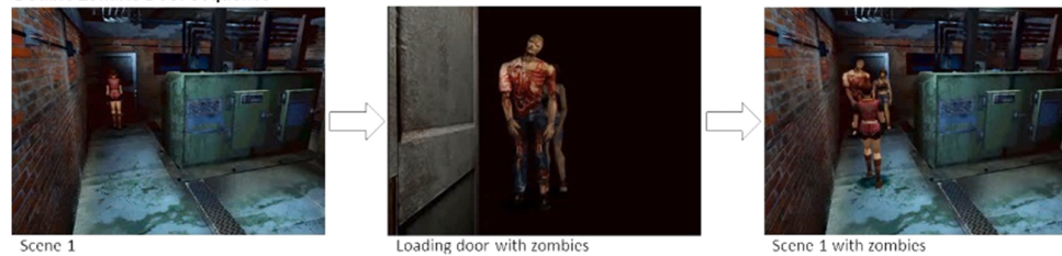
Figure 3: The top row shows the typical loading door sequence of Resident Evil 2 where a new scene is loaded. The bottom row shows the misdirection of the game's "Double Zombie Door" loading sequence.

Resident Evil 2 (Capcom 1998) continued the series' iconic loading sequences that separate physically adjacent areas. The game's playable environments are prerendered with fixed camera angles. However, its loading sequences feature a black screen with a real-time rendered, 3D representation of the diegetic physical threshold between the two distinctly loaded sections (commonly a doorway or gate). In these loading sequences, an animated camera moves the player's view through the threshold. The sequence employs a first-person perspective, contrasting from the third-person perspective used during playable sections. Typically, a door or gate opening animation and sound effect punctuate the transition. This case is interesting in its blend of simultaneous diegetic and hypermediated qualities. Each instance of loading in the game uses distinct 3D models and sound effects to match the environmental context of the connected scenes. While this diegetic quality maintains an element of narrative grounding and spatial immersion, the vacant black background, jarring change in perspective, and predictable pacing plainly announces to players: "this is a loading screen." The loading screens call so much attention to themselves that fans have created top lists and even fan made versions (Ink Ribbon 2020; Tillian 2013).