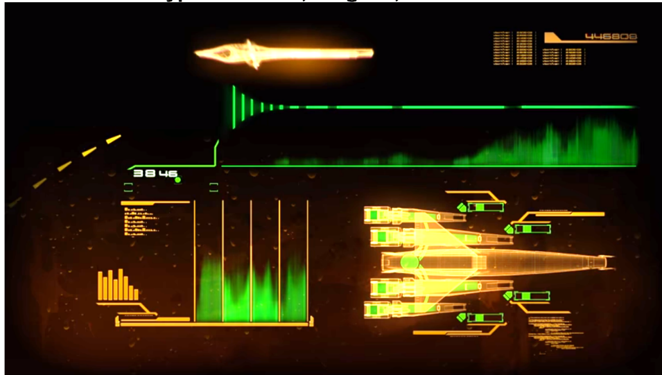
Figure 2: Screenshot of a loading screen in Mass Effect 2 .

In contrast to its predecessor, Mass Effect 2 (BioWare 2010) uses passive, hypermediated loading screens to mask loading. As seen in Figure 2, these loading screens have a diegetic quality, with imagery depicting the futuristic ship's diagnostic information like what one of the game's shipboard computers might display. Notably, this information is not legible and has no pedagogic quality.